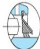
三重密封(后加R3) Triple-lip seal (+Suffix-R3)